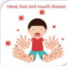
HAND-FOOT-MOUTH DISEASE SYMPTOMS

Do you know what the 3 stages are in the development of chickenpox spots?