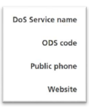
Figure 12.1: Example of the information the DoS profile updater asks you to review

NHS Digital will prepare a report for NHS England and NHS Improvement of the contractors who have made a submission to the DoS profile updater each quarter, which will be used for contract management purposes.